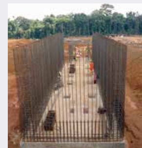
Above left: view from the reagent terrace, showing thickener base and mill excavations. Right: stockpile tunnel foundations & rebar